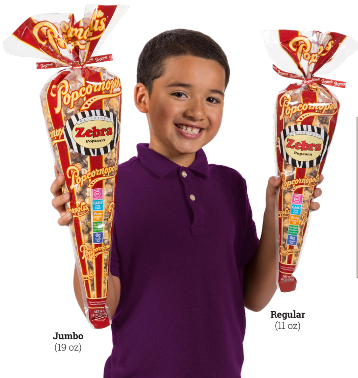
Jumbo (19 oz)

One Last Thing. Consider turning your product distribution day into a SPECIAL POPCORN EVENT and celebrate the success of your fundraising efforts with the community that made it possible.