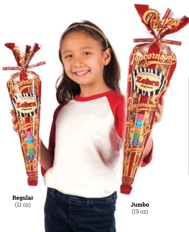
Regular (11 oz)

One Last Thing. Consider turning your product distribution day into a SPECIAL POPCORN EVENT and celebrate the success of your fundraising efforts with the community that made it possible.